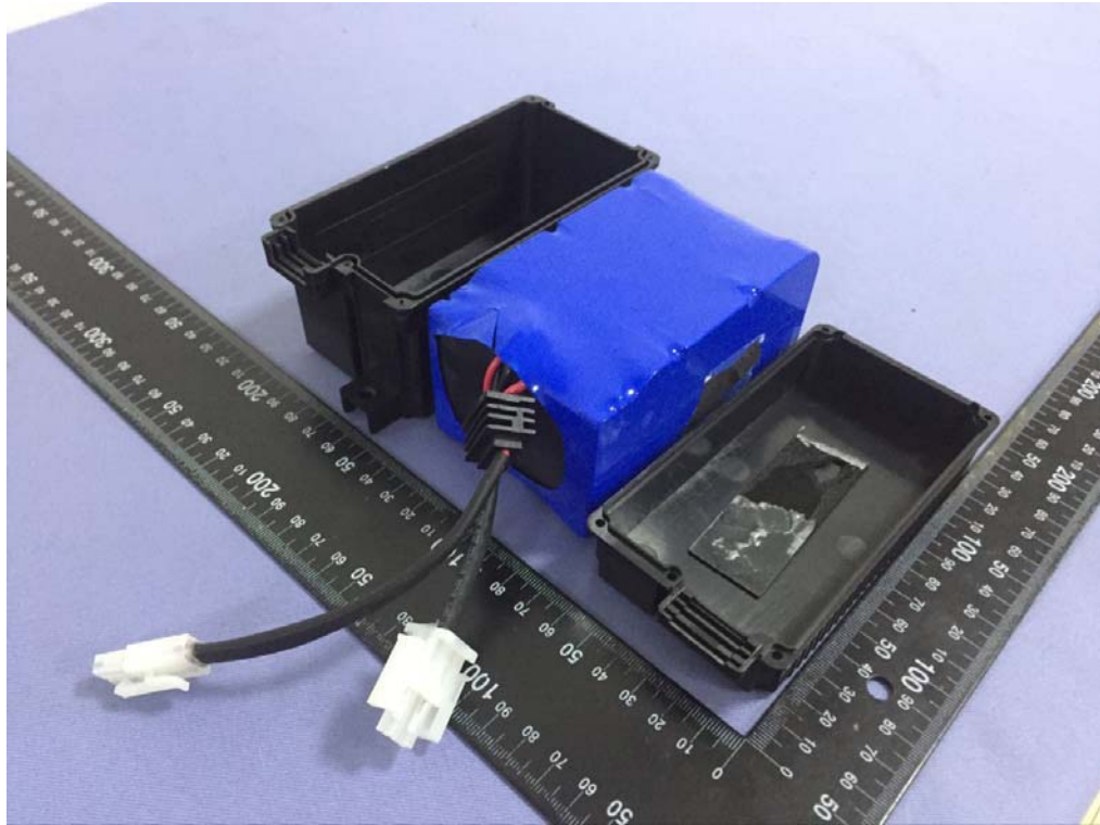
Figure 3 Internal view of battery