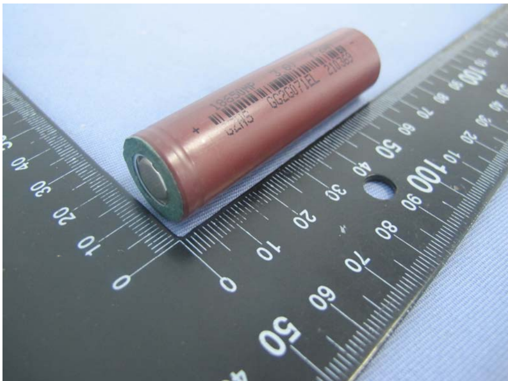
Figure 4 General view of cell